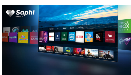
SAPHI is a fast, intuitive operating system that makes your Philips Smart TV a real pleasure to

use. Enjoy great picture quality and one-button access to a clear icon-based menu. Operate your TV with ease, and quickly navigate to popular Philips Smart TV apps including YouTube, Netflix, and Amazon Prime Video.