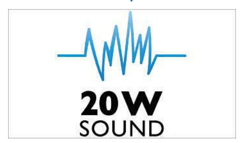
Rich & clear sound experience

"Feel the power of the music beat and the atmosphere of the movies. The powerful 20 \, W RMS ( 2 \times 10 \, W RMS) amplifiers create a lifelike soundstage. It gives a clear and spacious sound stage complementary to the rich viewing experience.."