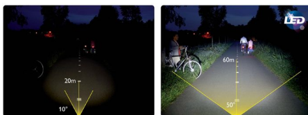
Standard 10 lux