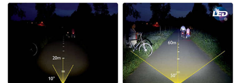
Standard 10 lux