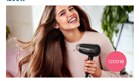
This 1200W hairdryer creates the optimum level of airflow and gentle drying power for beautiful results every day.