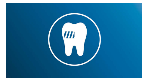
Removes up to 7x more plaque than a manual toothbrush for a superior clean