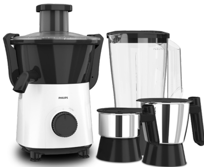
Juicer mixer grinder

HL7566/00 HL7567/00 HL7568/00 HL7568/01 HL7567/01