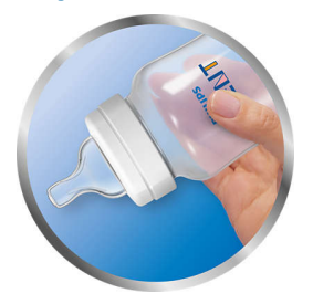
Easy to hold

The unique bottle shape makes this bottle easy to hold and grip in any direction.