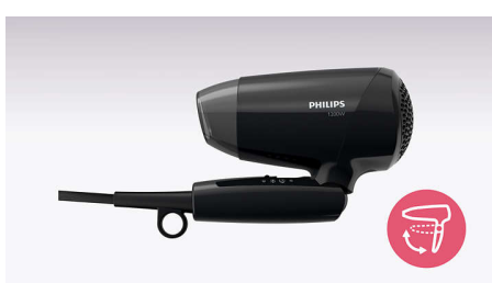
This hairdryer benefits from a foldable handle. The result is a small, compact hair dryer that will easily pack into the smallest spaces and you can take virtually anywhere.