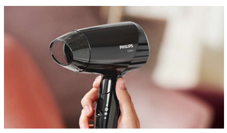
Concentrator focuses the airflow for a polished, shiny look