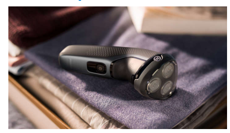
Keep the shaving head clean and safe between shaves or when traveling.