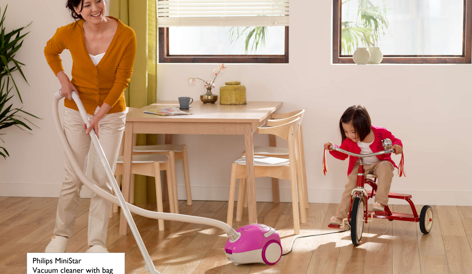
Philips MiniStar Vacuum cleaner with bag