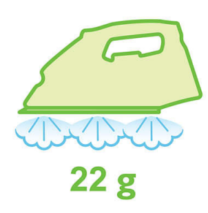
Up to 22 g/min of steam

Continuous steam up to 22 g/min for better crease removal.