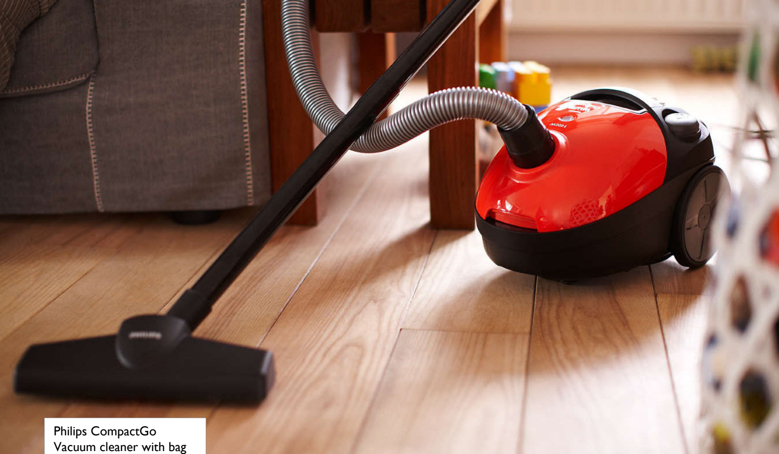
Philips CompactGo Vacuum cleaner with bag