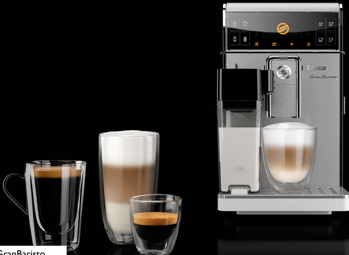
Saeco GranBaristo Super-automatic espresso machine