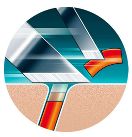
Lift & Cut

This unique dual blade system gently lifts hair into position for an incredibly close cut.