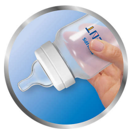
Easy to hold

The unique bottle shape makes this bottle easy to hold and grip in any direction.