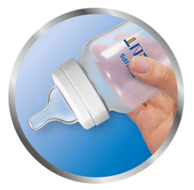
Easy to hold

The unique bottle shape makes this bottle easy to hold and grip in any direction.