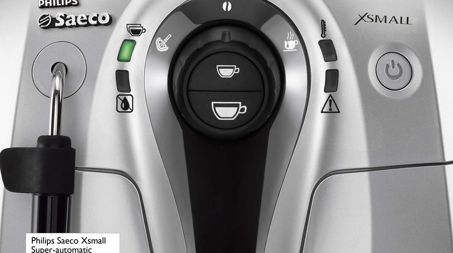
Philips Saeco Xsmall Super-automatic espresso machine