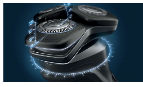
Designed to follow the contours of your face, this Philips electric shaver has fully flexible heads that turn 360° for a thorough and comfortable shave.