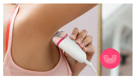
For more gentleness in different body areas it includes a delicate area cap to easily remove unwanted hairs from underarm and bikini.