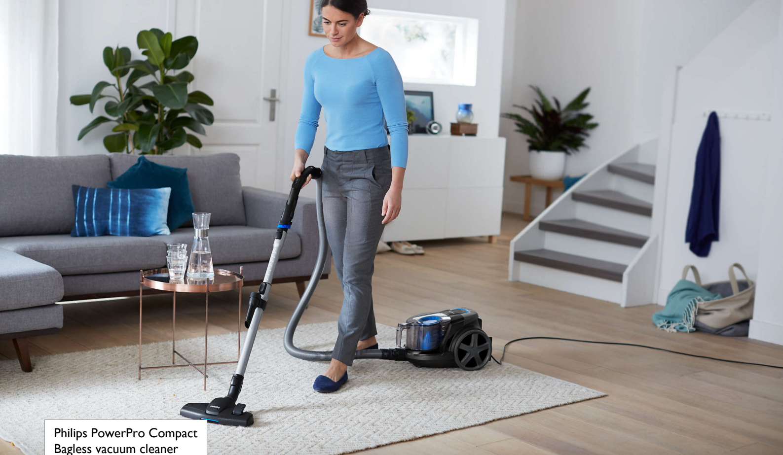
Philips PowerPro Compact Bagless vacuum cleaner