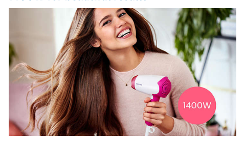
This 1400W hairdryer creates the optimum level of airflow and gentle drying power, for beautiful results every day.