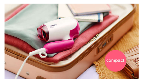
Compact and ergonomic, this hairdryer benefits from a clever modern design. This results in a dryer that is light and easy to handle yet small enough to store virtually anywhere.