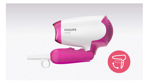
This hairdryer has foldable handle, making it easy to pack, store and take with you anywhere you go.