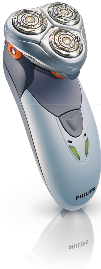
Philips SmartTouch-XL Electric shaver