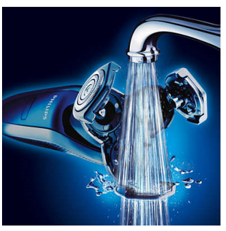
The waterproof shaver can be easily rinsed under the tap.