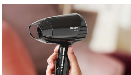
Concentrator focuses the airflow for a polished, shiny look