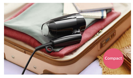
Compact and ergonomic, this hairdryer benefits from a clever modern design. This results in a dryer that is light and easy to handle.