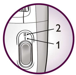
Speed 1 for extra gentle epilation and speed 2 for extra efficient epilation