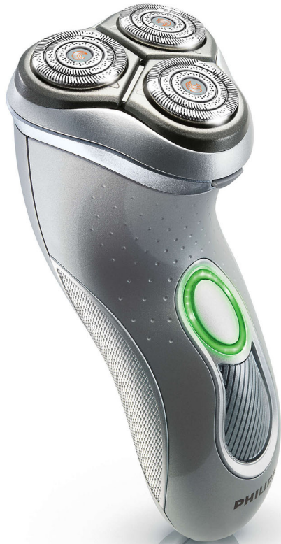
Philips Speed-XL Electric shaver