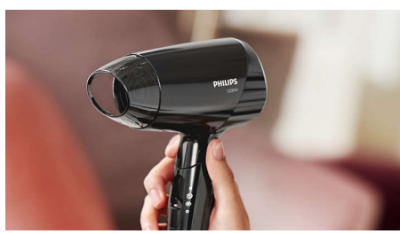
Concentrator focuses the airflow for a polished, shiny look