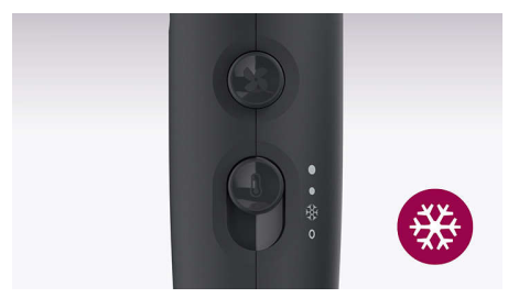
The cool air setting provides a burst of cold air to finish and hold your style.