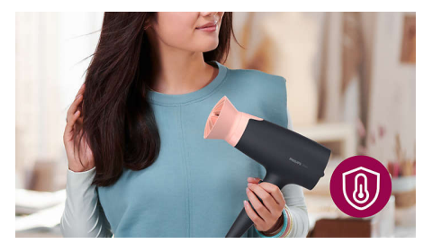
The uniquely-designed ThermoProtect attachment powerfully mixes warm and cool air for everyday care. It drops the temperature by 15°C while still drying your hair quickly.