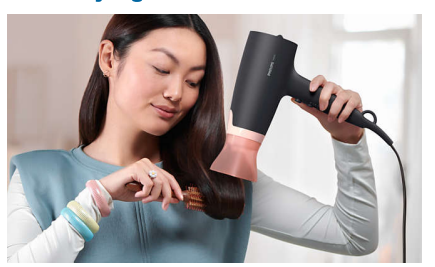
The slim nozzle precisely focuses the air, for quick touch-ups and perfecting small details of your style.