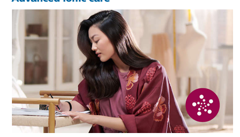
This powerful ionic system generates up to 20 million ions* per drying session, intensifying your hair's shine. So you can enjoy glossy, frizz-free hair.