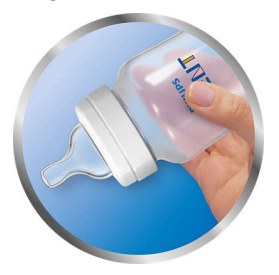
Easy to hold

The unique bottle shape makes this bottle easy to hold and grip in any direction.