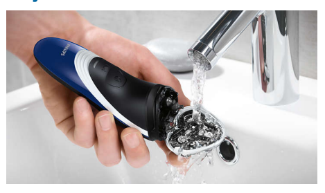
Simply pop the heads open, and rinse thoroughly under the tap.