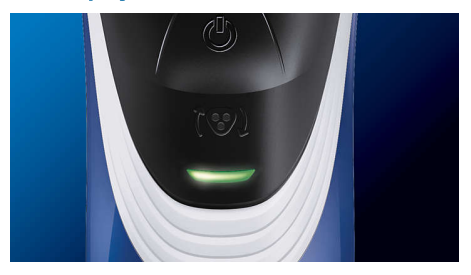
Indicates: Battery full, Battery low, Charging, Replace shaving heads, Quick charge