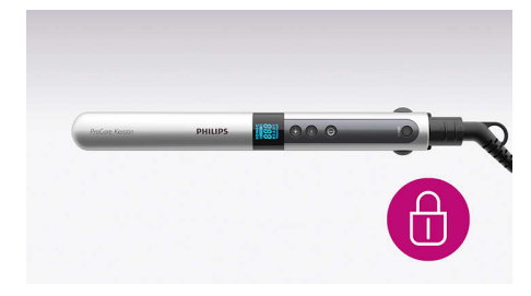
The plates can be locked together for safe and easy storage.