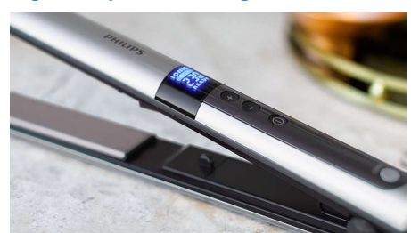
Digital display with 12 temperature settings up to 230°C gives you absolute control to adjust temperature to your hair type, for smooth results.