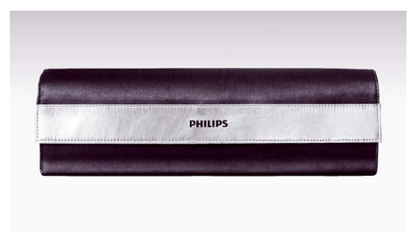
Included: heat resistant pouch