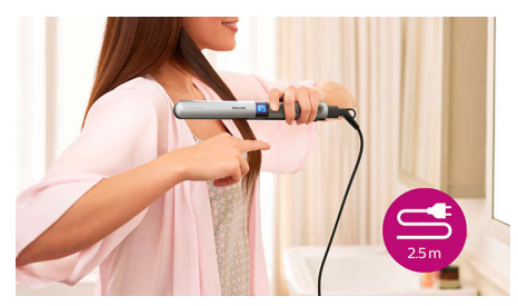
The professional 2.5m long cord reinforces the ease of use anywhere you want.