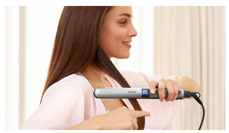
Gently vibrating plates spread hair evenly to enhance optimal styling results for all the hair.