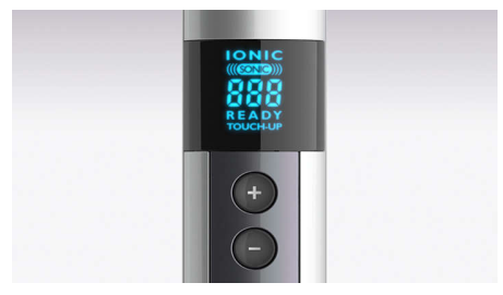
This shows when the styler has reached the right temperature, so you can instantly see when you're ready to style.