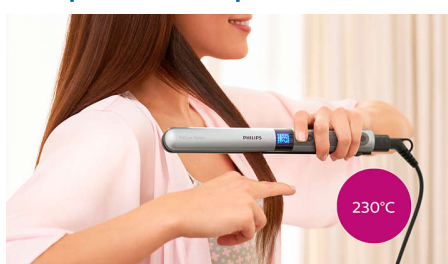
Professional high temperature enables you to change the style of your hair to achieve the look you want.