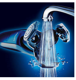
The waterproof shaver can be easily rinsed under the tap.