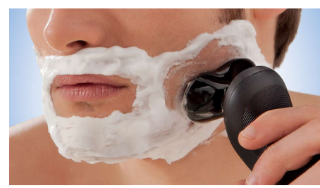
Shave wet with shaving cream for extra skin protection, or dry for convenience.