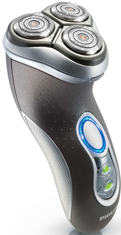
Philips Speed-XL Electric shaver