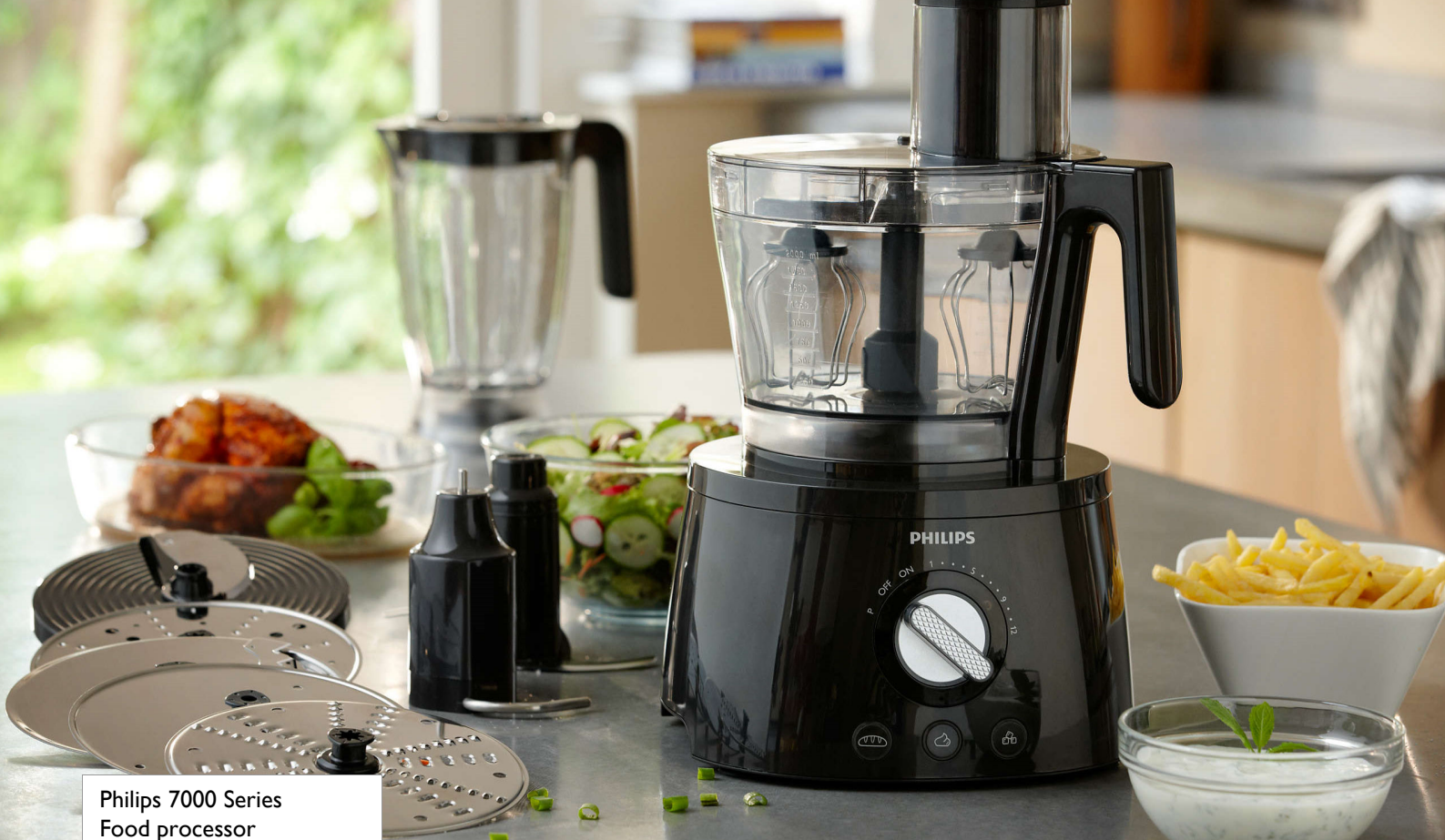
Philips 7000 Series Food processor