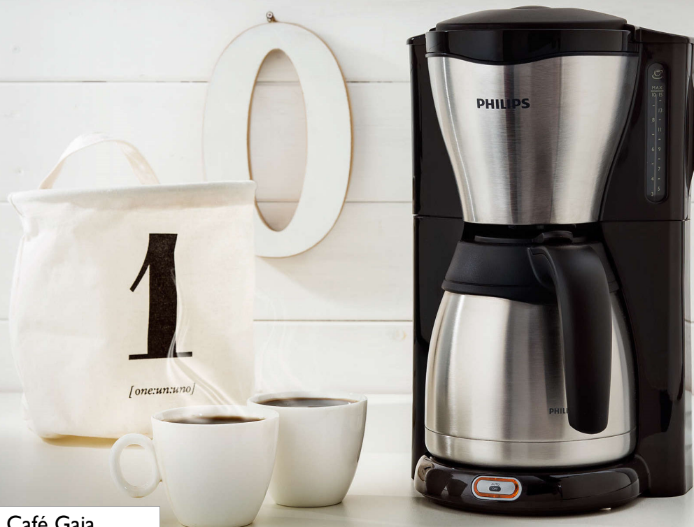
Philips Café Gaia Drip Filter Coffee Machine, thermo jug