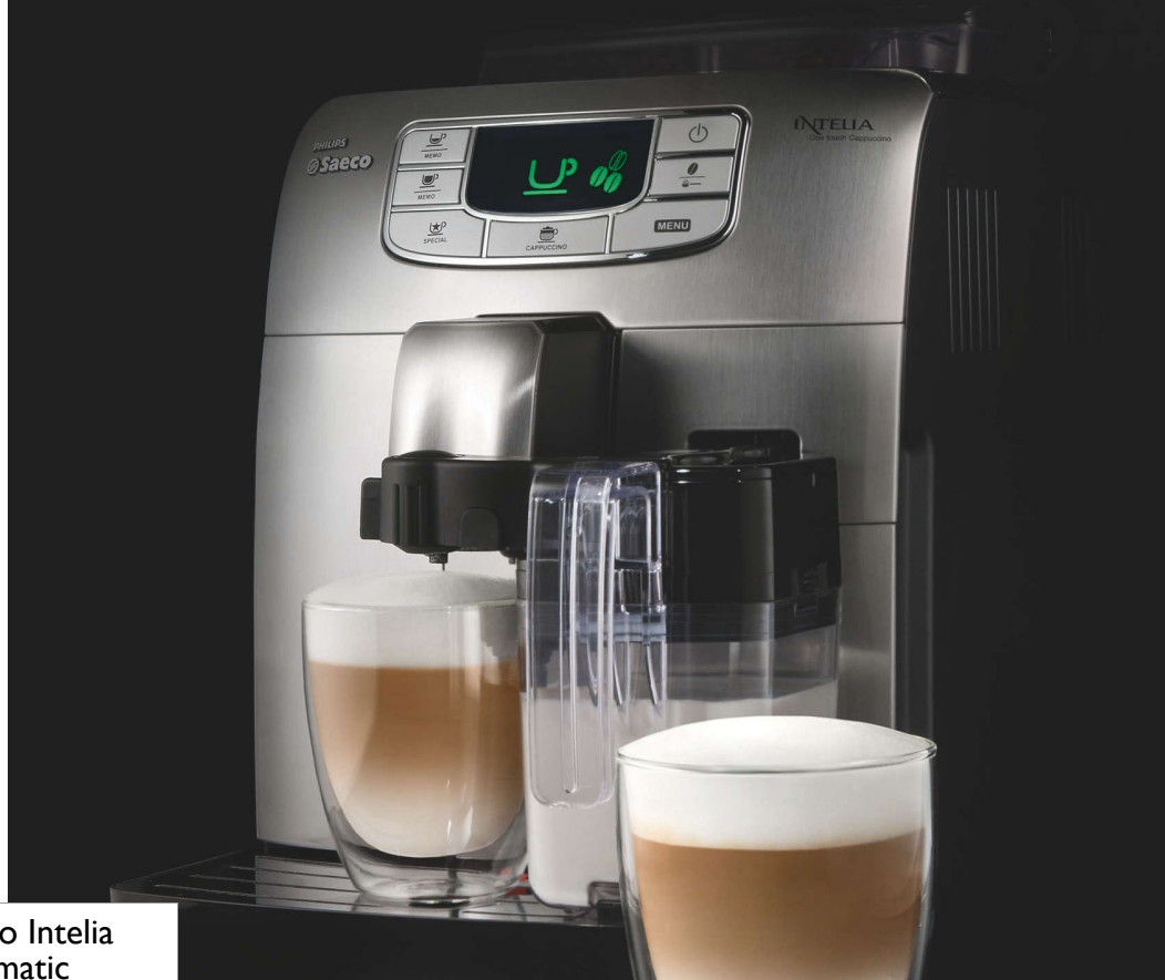
Philips Saeco Intelia Super-automatic espresso machine