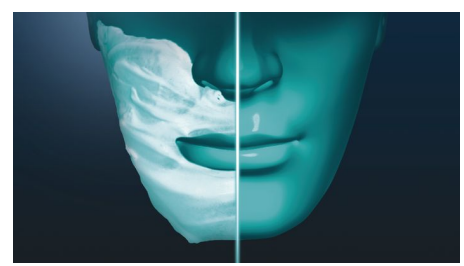
Choose how you prefer to shave. With the Aquatec Wet & Dry seal, you can opt for a quick yet comfortable dry shave. Or you can shave wet – with gel or foam – even under the shower.