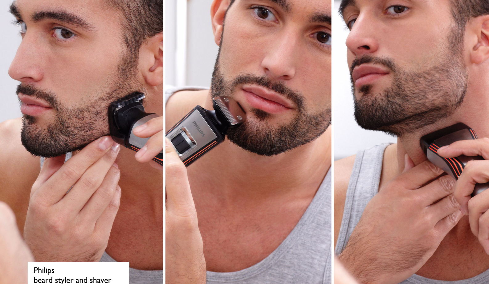
Philips beard styler and shaver