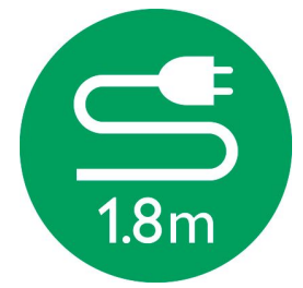
1.8 m cord

The straightener has a closing lock mechanism. Located at the base of the straightener, this locks plates, making storage quick and easy and helping to protect the straightener from accidental damage.