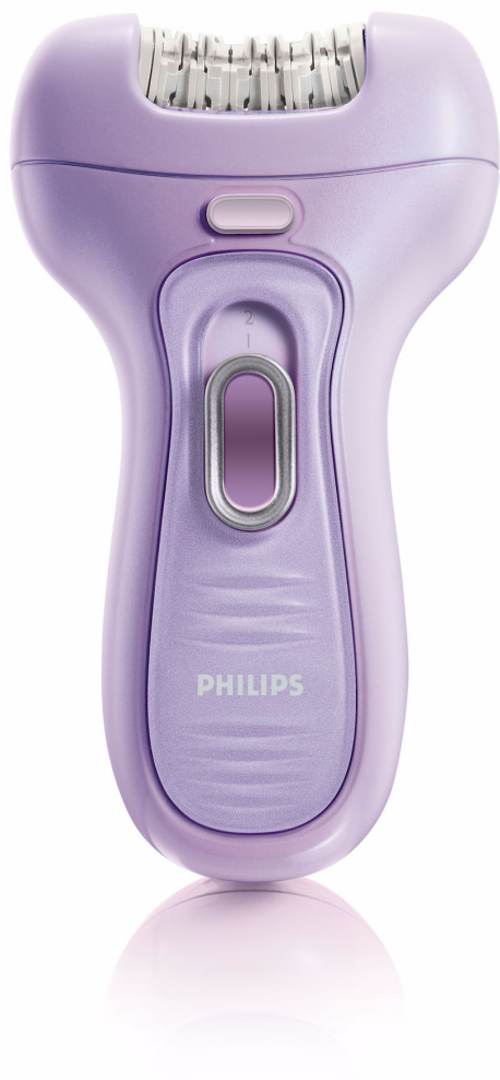
Philips Satinelle Epilator