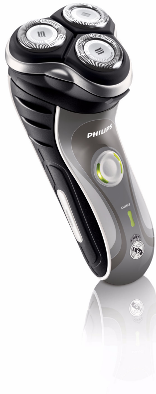
Philips 7000 series Electric shaver