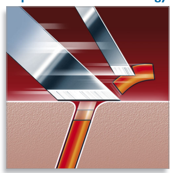
The dual blade system lifts hairs to cut comfortably