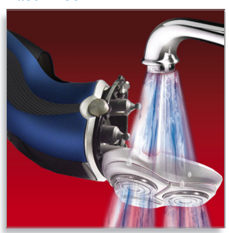
Anti-bacterial coating inside the shaving unit ensures that the shaver is rinsed clean in seconds.