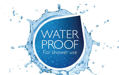
Comfortably trim and shave all your body hair, under the shower if you prefer.