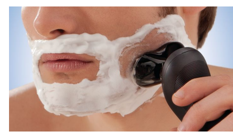
Shave wet with shaving cream for extra skin protection, or dry for convenience.