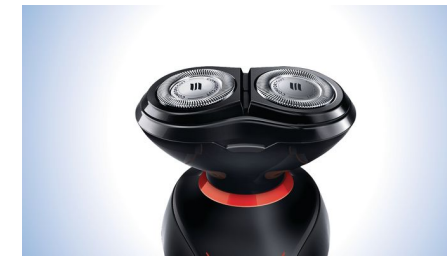
The dual rotary razor attachment is designed for an easy and clean shave with no nicks and cuts.