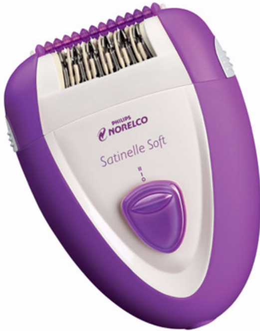
Philips Norelco Satinelle Epilator