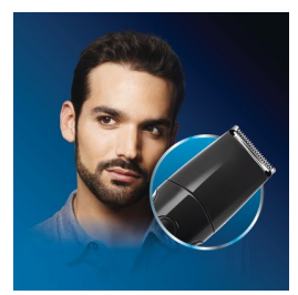
Using the full size trimmer without a comb results in a stubble beard look.