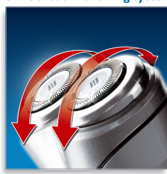
The 3D Contour-following system allows the individual shaving heads to move, enabling them to closely follow the curves of your face and neck. For a perfectly close shave, even in difficult-to-reach