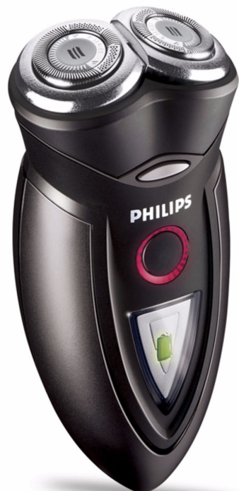
Philips 6000 series Electric shaver