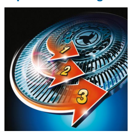
Triple-Track shaving heads

The three shaving tracks of the Triple-Track shaving heads offer 50% more shaving surface than standard, single track rotary shaving heads.